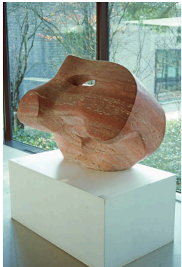
Object number: LH 575 Classifications: Sculpture Carving Title: Sculpture with Hole and Light Date: 1967 Medium: red travertine marble Ownership: Rijksmuseum Kröller-Müller, Otterlo