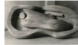
Object number: LH 538 Classifications: Sculpture Carving Title: Reclining Interior Oval Date: 1965 and 1968 Medium: red travertine marble Ownership: unknown