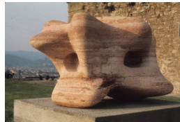
Object number: LH 620 Classifications: Sculpture Carving Title: Oblong Composition Date: 1970 Medium: red travertine marble Ownership: Staatliche Kunsthalle, Karlsruhe