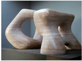
Object number: LH 555 Classifications: Sculpture Carving Title: Two Forms Date: 1966 Medium: red travertine marble Ownership: private collection , UK