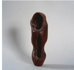
Object number: LH 293a plasticine Classifications: Sculpture Title: Maquette for Upright Internal/External Form: Flower Date: 1951 Medium: plasticine Ownership: The Henry Moore Foundation: gift of the artist 1977