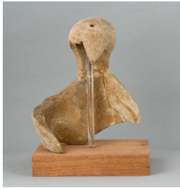
Object number: LH 304 plasticine Classifications: Sculpture Title: Helmet Head and Shoulders Date: 1952 Medium: plasticine Ownership: The Henry Moore Foundation: gift of the artist 1977