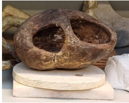
Object number: LH 718 plasticine Classifications: Sculpture Process Title: Egg Form: Pebbles Date: 1977 Medium: plasticine Ownership: The Henry Moore Foundation