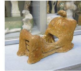
Object number: LH X124 Classifications: Sculpture Title: Reclining Figure: Idea for Wood Sculpture Date: c.1973 Medium: plasticine Ownership: The Henry Moore Foundation: gift of the artist 1977