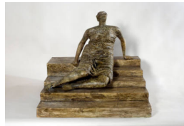
Object number: LH 427 plaster Classifications: Sculpture Title: Working Model for Draped Seated Woman: Figure on Steps Date: 1956 Medium: painted plaster Ownership: The Henry Moore Foundation: gift of the artist 1977