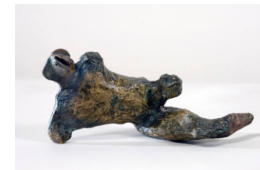
Object number: LH 358b plaster Classifications: Sculpture Title: Reclining Warrior Date: 1953 Medium: painted plaster Ownership: The Henry Moore Foundation: gift of the artist 1977