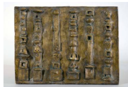
Object number: LH 366 plaster Classifications: Sculpture Title: Wall Relief: Maquette No. 2 Date: 1955 Medium: painted plaster Ownership: The Henry Moore Foundation: gift of the artist 1977