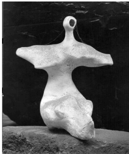
Object number: LH 463 plaster Classifications: Sculpture Title: Maquette for Seated Figure: Arms Outstretched Date: 1960 Medium: painted plaster Ownership: The Henry Moore Foundation: gift of the artist 1977