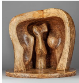
Object number: LH 651 plaster Classifications: Sculpture Title: Helmet Head No.6 Date: 1975 Medium: painted plaster Ownership: The Henry Moore Foundation: gift of the artist 1977