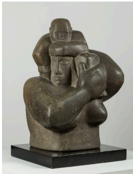
Object number: LH 26 Classifications: Sculpture Carving Title: Mother and Child Date: 1924-25 Medium: green Hornton stone Ownership: Manchester Art Gallery