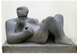
Object number: LH 84 Classifications: Sculpture Carving Title: Reclining Woman Date: 1930 Medium: green Hornton stone Ownership: National Gallery of Canada, Ottawa