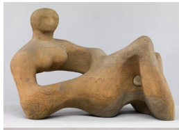
Object number: LH 191 Classifications: Sculpture Carving Title: Recumbent Figure Date: 1938 Medium: green Hornton stone Ownership: The Trustees of the Tate Gallery, London: presented by the Contemporary Arts Society, 1939