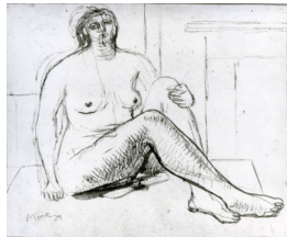
Object number: HMF 710a Classifications: Drawing Title: Seated Female Nude Date: 1929 Medium: brush and ink, wash Ownership: private collection, UK