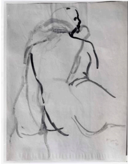
Object number: HMF 755 Classifications: Drawing Title: Seated Figure: Back View Date: 1930 Medium: brush and ink, wash Ownership: private collection, UK