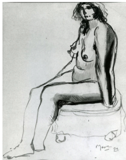
Object number: HMF 696b Classifications: Drawing Title: Seated Nude Date: 1929 Medium: brush and ink, wash Ownership: unknown