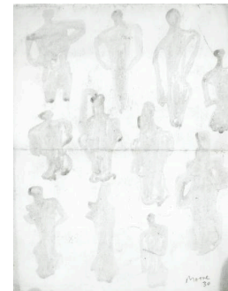
Object number: HMF 812 verso Classifications: Drawing Title: Eleven Standing Figures Date: 1930 Medium: brush and ink, wash Paper Support: cream medium-weight wove Ownership: The Henry Moore Foundation: gift of the artist 1977