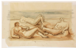
Object number: HMF 723 Classifications: Drawing Title: Three Nudes on a Beach Date: 1929 Medium: brush and ink, wash Ownership: Art Gallery of Ontario, Toronto: gift of Henry Moore 1974