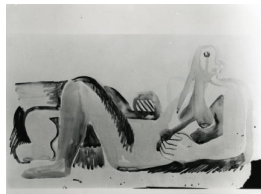
Object number: HMF 723 verso Classifications: Drawing Title: Reclining Nude Date: 1929 Medium: brush and ink, wash Ownership: Art Gallery of Ontario, Toronto: gift of Henry Moore 1974