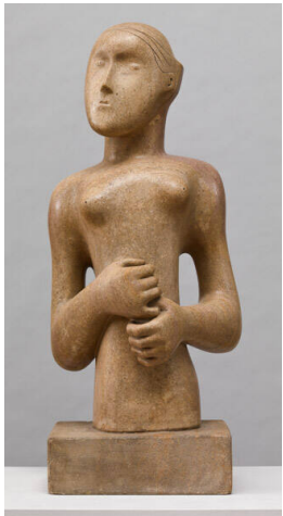
Object number: LH 109 Classifications: Sculpture Carving Title: Girl Date: 1931 Medium: Ancaster stone Ownership: The Trustees of the Tate Gallery, London: purchased 1952 with assistance of the Knapping Fund