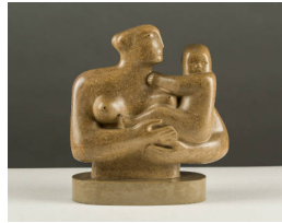
Object number: LH 82 Classifications: Sculpture Carving Title: Mother and Child Date: 1930 Medium: Ancaster stone Ownership: private collection