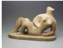
Object number: LH 94 Classifications: Sculpture Carving Title: Reclining Figure Date: 1930 Medium: Ancaster stone Ownership: Detroit Institute of Arts: Founders Society Purchase, Friends of Modern Art Fund