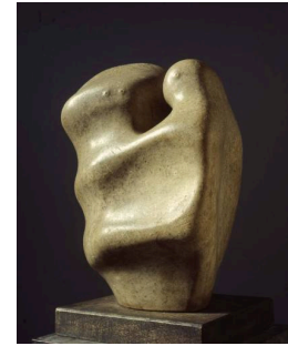
Object number: LH 165 Classifications: Sculpture Carving Title: Mother and Child Date: 1936 Medium: Ancaster stone Ownership: The British Council, London: purchased from the artist March 1948