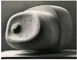
Object number: LH 176 Classifications: Sculpture Carving Title: Carving Date: 1937 Medium: Ancaster stone Ownership: unknown