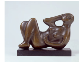
Object number: LH 85 cast b Classifications: Sculpture Title: Reclining Figure Date: 1930 cast 1962 Medium: bronze Ownership: Robert and Lisa Sainsbury Collection, University of East Anglia, Norwich: gift of Henry Moore 1962