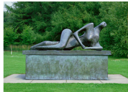
Object number: LH 402 cast 4 Classifications: Sculpture Title: Reclining Figure Date: 1956 cast 1961 Medium: bronze Ownership: Robert and Lisa Sainsbury Collection, University of East Anglia, Norwich