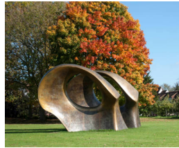
Object number: LH 560 cast 0 Classifications: Sculpture Title: Double Oval Date: 1966 Medium: bronze Ownership: The Henry Moore Foundation: acquired 1992