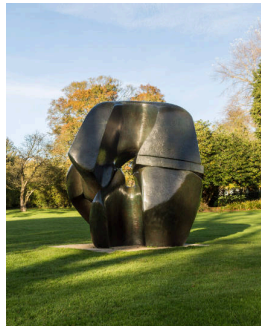
Object number: LH 515 cast 0 Classifications: Sculpture Title: Locking Piece Date: 1962-63 cast 1963 Medium: bronze Ownership: The Henry Moore Foundation: acquired 1987