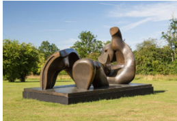
Object number: LH 655 cast 0 Classifications: Sculpture Title: Three Piece Reclining Figure: Draped Date: 1975 Medium: bronze Ownership: The Henry Moore Foundation: acquired 1987