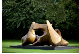
Object number: LH 580 cast 0 Classifications: Sculpture Title: Three Piece Sculpture: Vertebrae Date: 1968-69 Medium: bronze Ownership: The Henry Moore Foundation: acquired 1989