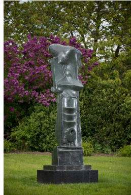
Object number: LH 388 cast a Classifications: Sculpture Title: Upright Motive No.8 Date: 1955-56 Medium: bronze Ownership: The Henry Moore Foundation: gift of the artist 1979