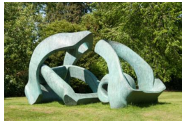
Object number: LH 636 cast 0 Classifications: Sculpture Title: Hill Arches Date: 1973 Medium: bronze Ownership: The Henry Moore Foundation: gift of the artist 1977