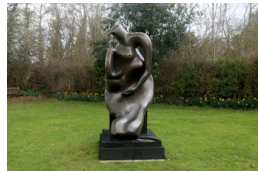
Object number: LH 838 cast 0 Classifications: Sculpture Title: Mother and Child: Block Seat Date: 1983-84 Medium: bronze Ownership: The Henry Moore Foundation: acquired 1986