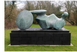
Object number: LH 641 cast 0 Classifications: Sculpture Title: Goslar Warrior Date: 1973-74 Medium: bronze Ownership: The Henry Moore Foundation: gift of the artist 1977