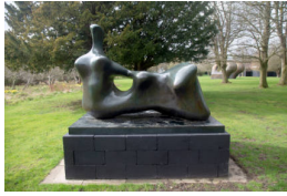
Object number: LH 709 cast 0 Classifications: Sculpture Title: Reclining Figure: Hand Date: 1979 Medium: bronze Ownership: The Henry Moore Foundation: acquired 1986