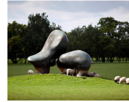
Object number: LH 627 cast 0 Classifications: Sculpture Title: Sheep Piece Date: 1971-72 Medium: bronze Ownership: The Henry Moore Foundation: gift of the artist 1977