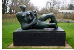
Object number: LH 649 cast 0 Classifications: Sculpture Title: Reclining Mother and Child Date: 1975-76 Medium: bronze Ownership: The Henry Moore Foundation: acquired 1986