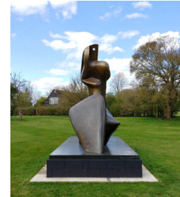
Object number: LH 758 cast 0 Classifications: Sculpture Title: Two Piece Reclining Figure: Cut Date: 1979-81 Medium: bronze Ownership: The Henry Moore Foundation: acquired 1986