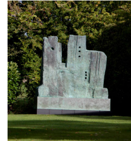
Object number: LH 483 cast 0 Classifications: Sculpture Title: The Wall: Background for Sculpture Date: 1962 Medium: bronze Ownership: The Henry Moore Foundation: gift of the artist 1977