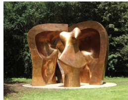
Object number: LH 652c cast 0 Classifications: Sculpture Title: Large Figure in a Shelter Date: 1985-86 Medium: bronze Ownership: The Henry Moore Foundation: acquired 1987