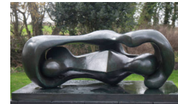
Object number: LH 612 cast 7 Classifications: Sculpture Title: Reclining Connected Forms Date: 1969 Medium: bronze Ownership: The Henry Moore Foundation: gift of the artist 1977