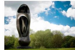
Object number: LH 297a cast 0 Classifications: Sculpture Title: Large Upright Internal / External Form Date: 1953-54 cast 1981-82 Medium: bronze Ownership: The Henry Moore Foundation: acquired 1986