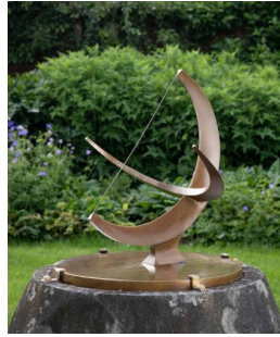
Object number: LH 527 cast i Classifications: Sculpture Title: Working Model for Sundial Date: 1965 Medium: bronze Ownership: The Henry Moore Foundation: gift of Sir Denis Hamilton 1986