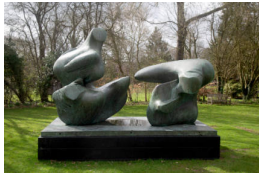
Object number: LH 606 cast 0 Classifications: Sculpture Title: Two Piece Reclining Figure: Points Date: 1969 Medium: bronze Ownership: The Henry Moore Foundation: gift of the artist 1977