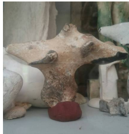
Object number: FO 1 Classifications: Found Objects (unworked) Title: Flint for Maquette for Seated Figure: Arms Outstretched (LH 463) Date: not known Medium: flint with plasticine base Ownership: The Henry Moore Foundation: gift of the artist 1977