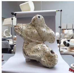
Object number: LH 463a mould Classifications: Sculpture Process Title: Mould for Working Model for Seated Figure: Arms Outstretched Date: 1982 Medium: plaster mould Ownership: The Henry Moore Foundation