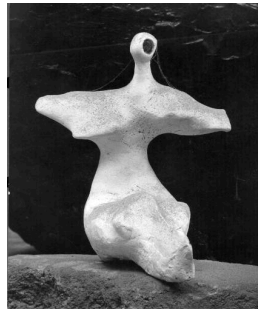
Object number: LH 463 plaster Classifications: Sculpture Title: Maquette for Seated Figure: Arms Outstretched Date: 1960 Medium: painted plaster Ownership: The Henry Moore Foundation: gift of the artist 1977