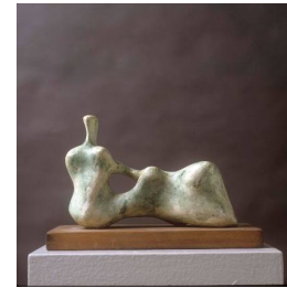
Object number: LH 707 plaster Classifications: Sculpture Title: Maquette for Reclining Figure: Hand Date: 1976 Medium: plaster Ownership: The Henry Moore Foundation: gift of the artist 1977