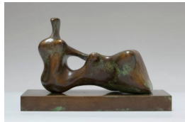
Object number: LH 707 cast 0 Classifications: Sculpture Title: Maquette for Reclining Figure: Hand Date: 1976 cast 1977 Medium: bronze Ownership: The Henry Moore Foundation: acquired 1986