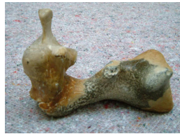
Object number: LH 707 bone Classifications: Sculpture Title: Maquette for Reclining Figure: Hand Date: 1976 Medium: bone, flint and plasticine Ownership: The Henry Moore Foundation: gift of the artist 1977