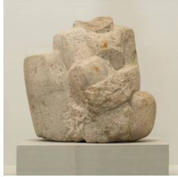
Object number: LH 19 Classifications: Sculpture Carving Title: Seated Figure Date: 1924 Medium: Hopton Wood stone Ownership: The Henry Moore Foundation: gift of the artist 1977