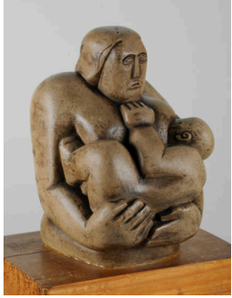
Object number: LH 22 Classifications: Sculpture Carving Title: Maternity Date: 1924 Medium: Hopton Wood stone Ownership: Leeds Museums and Galleries (Leeds Art Gallery)