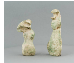
Object number: LH 680 plaster Classifications: Sculpture Title: Girl and Dwarf Date: 1975 Medium: plaster Ownership: The Henry Moore Foundation: gift of the artist 1977