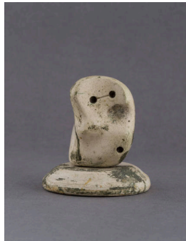
Object number: LH 818 plaster Classifications: Sculpture Title: Curved Head Date: 1981 Medium: plaster Ownership: The Henry Moore Foundation: acquired 1993