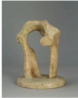
Object number: LH 503a plaster Classifications: Sculpture Title: Maquette for Large Torso: Arch Date: 1962 Medium: plaster Ownership: The Henry Moore Foundation: gift of the artist 1977