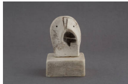
Object number: LH X114 Classifications: Sculpture Title: Maquette for Cathedral Head Date: c.1968 Medium: plaster Ownership: The Henry Moore Foundation: gift of the artist 1977