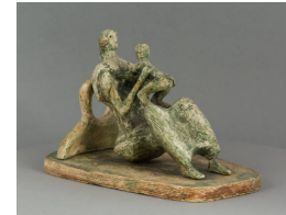
Object number: LH 697 plaster Classifications: Sculpture Title: Maquette for Mother and Child: Arms Date: 1976 Medium: plaster Ownership: The Henry Moore Foundation: gift of the artist 1977