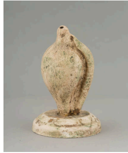
Object number: LH 802 plaster Classifications: Sculpture Title: Small Shell Mother and Child Date: 1980 Medium: plaster Ownership: The Henry Moore Foundation: acquired 1993