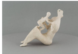
Object number: LH X128 Classifications: Sculpture Title: Maquette for Mother and Child: Arms Date: 1976 Medium: plaster Ownership: The Henry Moore Foundation: gift of the artist 1977