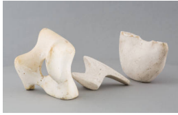
Object number: LH 501 plaster Classifications: Sculpture Title: Three Piece Reclining Figure: Maquette No.2: Polished Date: 1962 Medium: plaster Ownership: The Henry Moore Foundation: gift of the artist 1977