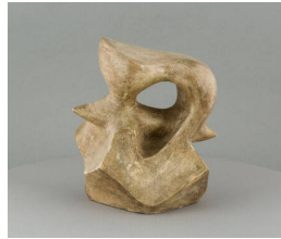
Object number: LH 591 plaster Classifications: Sculpture Title: Maquette for Spindle Piece Date: 1968 Medium: plaster Ownership: The Henry Moore Foundation: gift of the artist 1977