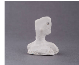
Object number: LH X7 Classifications: Sculpture Process Title: Maquette for Head I Date: undated Medium: plaster Ownership: The Henry Moore Foundation: acquired 1993