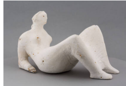
Object number: LH 704 cast a Classifications: Sculpture Title: Maquette for Draped Reclining Figure Date: 1976 Medium: plaster cast Ownership: The Henry Moore Foundation: gift of the artist 1977