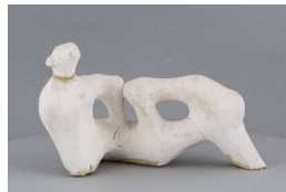
Object number: LH 656 cast a Classifications: Sculpture Title: Maquette for Reclining Figure: Holes Date: 1975 Medium: plaster cast Ownership: The Henry Moore Foundation: gift of the artist 1977