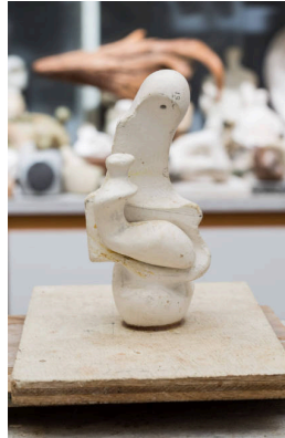
Object number: LH 849 plaster cast Classifications: Sculpture Title: Maquette for Mother and Child: Hood Date: 1982 Medium: plaster cast Ownership: The Henry Moore Foundation: acquired 1993