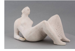
Object number: LH 704 cast b Classifications: Sculpture Title: Maquette for Draped Reclining Figure Date: 1976 Medium: plaster cast Ownership: The Henry Moore Foundation: gift of the artist 1977