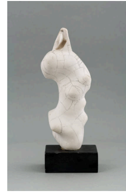
Object number: LH 796 plaster cast Classifications: Sculpture Title: Maquette for Three-Quarter Figure: Lines Date: 1980 Medium: plaster cast Ownership: The Henry Moore Foundation: acquired 1993