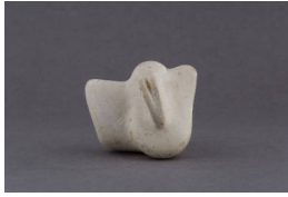
Object number: LH 702 cast a Classifications: Sculpture Title: Butterfly Date: 1976 Medium: plaster cast Ownership: The Henry Moore Foundation: gift of the artist 1977