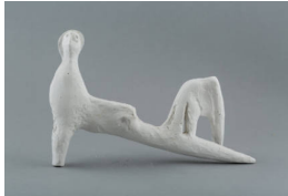
Object number: LH 721 cast a Classifications: Sculpture Title: Reclining Figure: Stiff Leg Date: 1977 Medium: plaster cast Ownership: The Henry Moore Foundation: acquired 1993