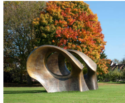
Object number: LH 560 cast 0 Classifications: Sculpture Title: Double Oval Date: 1966 Medium: bronze Ownership: The Henry Moore Foundation: acquired 1992