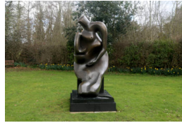
Object number: LH 838 cast 0 Classifications: Sculpture Title: Mother and Child: Block Seat Date: 1983-84 Medium: bronze Ownership: The Henry Moore Foundation: acquired 1986