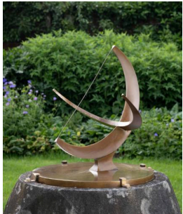
Object number: LH 527 cast i Classifications: Sculpture Title: Working Model for Sundial Date: 1965 Medium: bronze Ownership: The Henry Moore Foundation: gift of Sir Denis Hamilton 1986