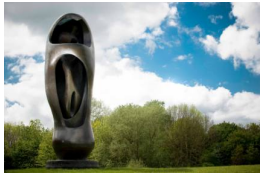
Object number: LH 297a cast 0 Classifications: Sculpture Title: Large Upright Internal /External Form Date: 1953-54 cast 1981-82 Medium: bronze Ownership: The Henry Moore Foundation: acquired 1986