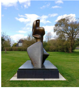
Object number: LH 758 cast 0 Classifications: Sculpture Title: Two Piece Reclining Figure: Cut Date: 1979-81 Medium: bronze Ownership: The Henry Moore Foundation: acquired 1986