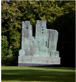
Object number: LH 483 cast 0 Classifications: Sculpture Title: The Wall: Background for Sculpture Date: 1962 Medium: bronze Ownership: The Henry Moore Foundation: gift of the artist 1977