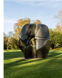
Object number: LH 515 cast 0 Classifications: Sculpture Title: Locking Piece Date: 1962-63 cast 1963 Medium: bronze Ownership: The Henry Moore Foundation: acquired 1987