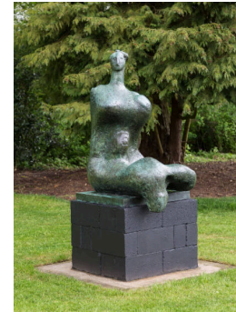
Object number: LH 439 cast a Classifications: Sculpture Title: Woman Date: 1957-58 cast 1960 Medium: bronze Ownership: The British Council, London