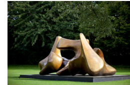
Object number: LH 580 cast 0 Classifications: Sculpture Title: Three Piece Sculpture: Vertebrae Date: 1968-69 Medium: bronze Ownership: The Henry Moore Foundation: acquired 1989