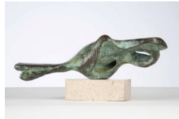
Object number: LH 445 cast b Classifications: Sculpture Title: Bird Date: 1959 Medium: bronze Ownership: Gwendolyn Weiner Collection; on long-term loan to the Palm Springs Art Museum