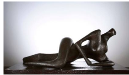
Object number: LH 402 cast 3 Classifications: Sculpture Title: Reclining Figure Date: 1956 cast 1961 Medium: bronze Ownership: Palm Springs Art Museum; Partial and promised gift of Gwendolyn Weiner