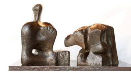
Object number: LH 478 cast 1 Classifications: Sculpture Title: Two Piece Reclining Figure No.3 Date: 1961 Medium: bronze Ownership: Palm Springs Art Museum; Gift of Gwendolyn Weiner