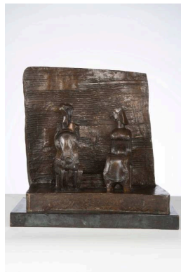
Object number: LH 454 cast b Classifications: Sculpture Title: Two Seated Figures against Wall Date: 1960 Medium: bronze Ownership: Gwendolyn Weiner Collection; on long-term loan to the Palm Springs Art Museum