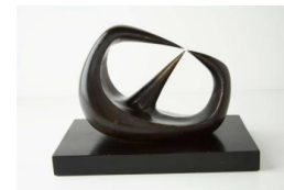
Object number: LH 211 cast c Classifications: Sculpture Title: Three Points Date: 1939-40 cast 1959 Medium: bronze Ownership: Collection of Gwendolyn Weiner; on long-term loan to Palm Springs Art Museum