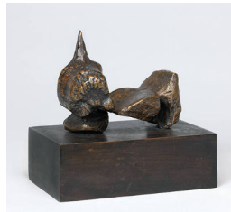
Object number: LH 477 cast 2 Classifications: Sculpture Title: Two Piece Reclining Figure: Maquette No.5 Date: 1962 Medium: bronze Ownership: The Fitzwilliam Museum, Cambridge