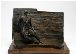
Object number: LH 423 cast h Classifications: Sculpture Title: Draped Seated Figure against Curved Wall Date: 1956-57 cast 1957 Medium: bronze Ownership: The Fitzwilliam Museum, Cambridge: purchased from the artist 1960