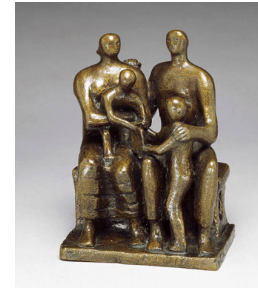
Object number: LH 228 cast a Classifications: Sculpture Title: Family Group Date: 1944 cast c.1945 Medium: bronze Ownership: The Fitzwilliam Museum, Cambridge