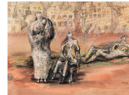
Object number: HMF 1556 Classifications: Drawing Title: Standing, Seated and Reclining Figures against a background of Bombed Buildings Date: 1940 Medium: pencil, wax crayon, pastel, watercolour wash, pen and ink Paper Support: cream medium-weight wove Ownership: On loan to the Fitzwilliam Museum from King's College, Cambridge.