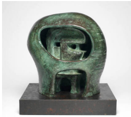
Object number: LH 467 cast 1 Classifications: Sculpture Title: Helmet Head No.3 Date: 1960 Medium: bronze Ownership: The Fitzwilliam Museum, Cambridge