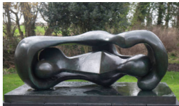
Object number: LH 612 cast 7 Classifications: Sculpture Title: Reclining Connected Forms Date: 1969 Medium: bronze Ownership: The Henry Moore Foundation: gift of the artist 1977