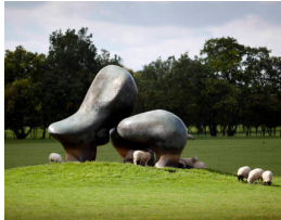
Object number: LH 627 cast 0 Classifications: Sculpture Title: Sheep Piece Date: 1971-72 Medium: bronze Ownership: The Henry Moore Foundation: gift of the artist 1977