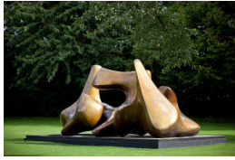
Object number: LH 580 cast 0 Classifications: Sculpture Title: Three Piece Sculpture: Vertebrae Date: 1968-69 Medium: bronze Ownership: The Henry Moore Foundation: acquired 1989