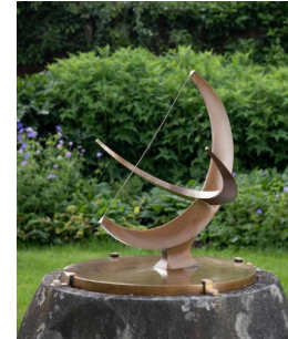
Object number: LH 527 cast i Classifications: Sculpture Title: Working Model for Sundial Date: 1965 Medium: bronze Ownership: The Henry Moore Foundation: gift of Sir Denis Hamilton 1986