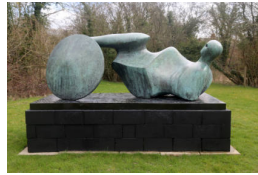
Object number: LH 641 cast 0 Classifications: Sculpture Title: Goslar Warrior Date: 1973-74 Medium: bronze Ownership: The Henry Moore Foundation: gift of the artist 1977