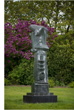
Object number: LH 388 cast a Classifications: Sculpture Title: Upright Motive No.8 Date: 1955-56 Medium: bronze Ownership: The Henry Moore Foundation: gift of the artist 1979