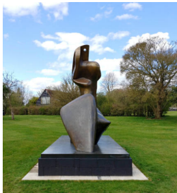
Object number: LH 758 cast 0 Classifications: Sculpture Title: Two Piece Reclining Figure: Cut Date: 1979-81 Medium: bronze Ownership: The Henry Moore Foundation: acquired 1986