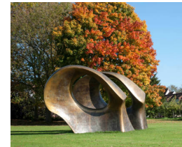
Object number: LH 560 cast 0 Classifications: Sculpture Title: Double Oval Date: 1966 Medium: bronze Ownership: The Henry Moore Foundation: acquired 1992