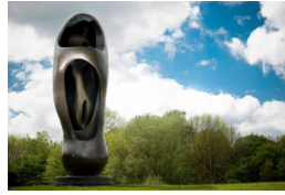
Object number: LH 297a cast 0 Classifications: Sculpture Title: Large Upright Internal / External Form Date: 1953-54 cast 1981-82 Medium: bronze Ownership: The Henry Moore Foundation: acquired 1986